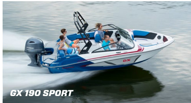
GX 190 SPORT

LOA 19' 5.8 m BEAM 8'2" 2.5 m CAPACITY 9 People 8 CE APPROX. WEIGHT 3100 lbs 1406 kg