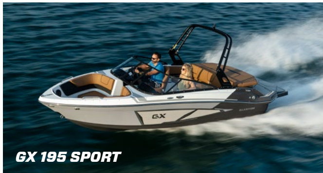
GX 195 SPORT

LOA 19' 5.8 m BEAM 8'2" 2.5 m CAPACITY 8 People 8 CE APPROX. WEIGHT 3400 lbs 1542 kg