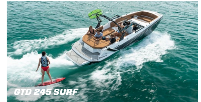
GTD 245 SURF

LOA 22'4" 6.8 m BEAM 8'6" 2.54 m CAPACITY 13 People 10 CE APPROX. WEIGHT 4250 lbs 1928 kg