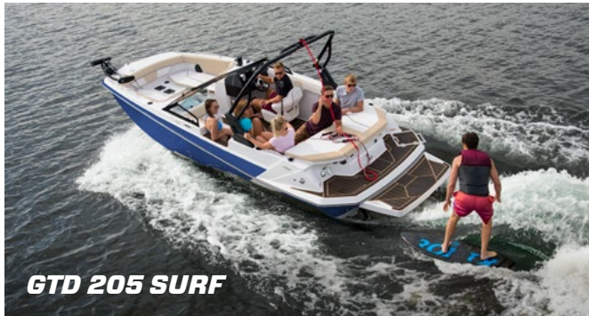
GTD 205 SURF

LOA 20'4" 6.2 m BEAM 8'6" 2.54 m CAPACITY 11 People 9 CE APPROX. WEIGHT 3800 lbs 1724 kg