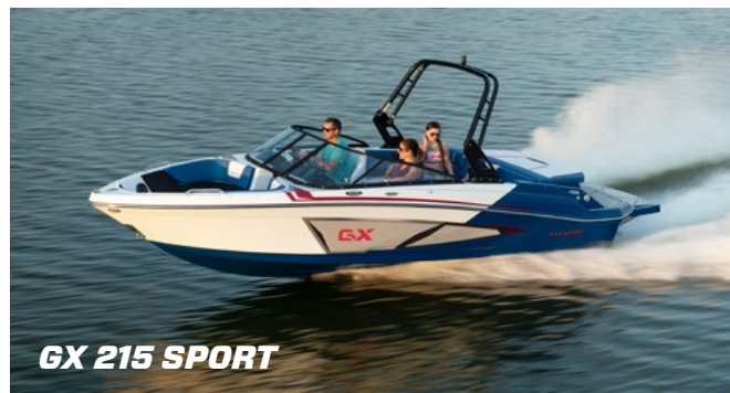
GX 215 SPORT

LOA 21' 6.4 m BEAM 8'4" 2.54 m CAPACITY 10 People 9 CE APPROX. WEIGHT 3900 lbs 1769 kg