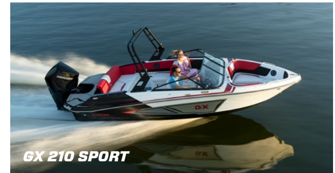
GX 210 SPORT

LOA 21' 6.4 m BEAM 8'4" 2.54 m CAPACITY 11 People 9 CE APPROX. WEIGHT 3200 lbs 1452 kg