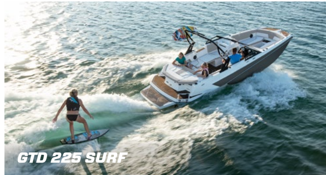
GTD 225 SURF

LOA 20'4" 6.2 m BEAM 8'6" 2.54 m CAPACITY 11 People 9 CE APPROX. WEIGHT 3800 lbs 1724 kg